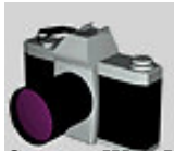
CALLIOPE WISH LIST

The Calliope office is looking for a gently used laptop and digital camera. If you've recently upgraded either, consider making a donation to Calliope. In return, you'll get a tax deduction letter and our eternal gratitude.